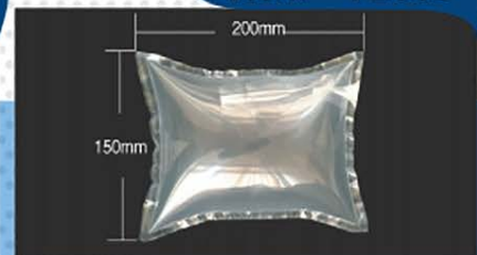
Item # 72003

(200mm x 150mm) x 300m Total pillow made per roll : 1,800pcs (롤 당 1,800개가 만들어집니다)