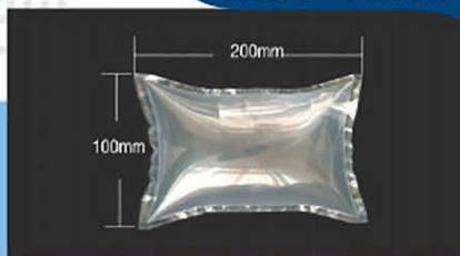
Item # 72002

(200mm x 100mm) x 300m Total pillow made per roll : 2,700pcs (롤 당 2,700개가 만들어집니다)