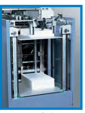
Paper feeding system.