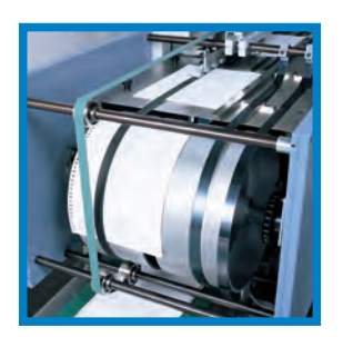
Sequence keeping device.