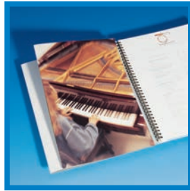
Sample bound using the WB-450.