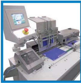
Touch screen and closing system.