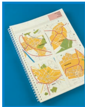
Sample bound using the WB-450.